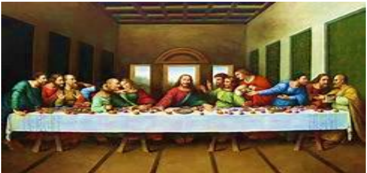
Leonardo da Vinci famous painting The Last Supper.